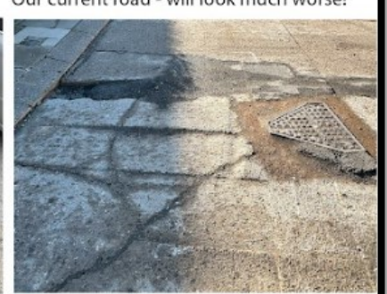
Please sign this petition if you believe in maintaining our community's safety standards while preserving its aesthetic appeal.